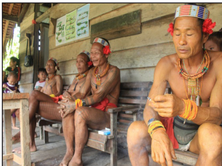
Picture 1: Sikerei Implementing the Mentulai Arat Sabulungan Tradition

However, from the description that the writers revealed above, this is in contrast if seen from the implementation of tradition and how important of Arat Sabulungan is for the Mentawai people, because this is ingrained for them. If viewed