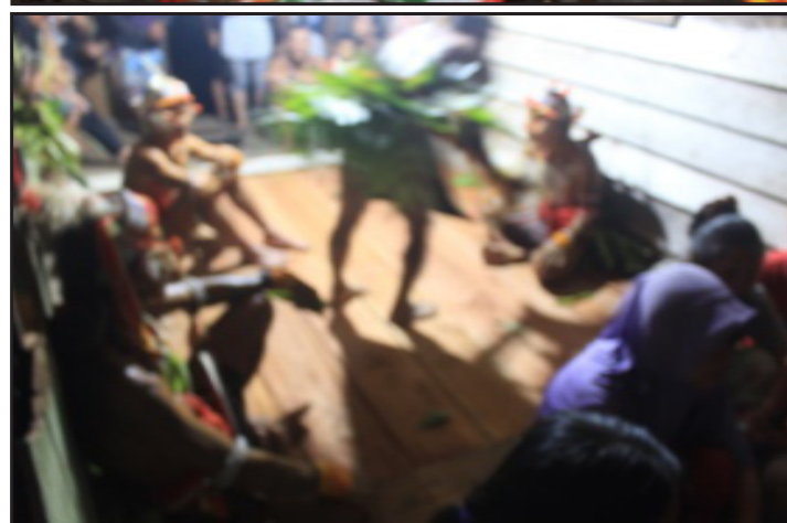
Picture 2: Arat Sabulungan Procession