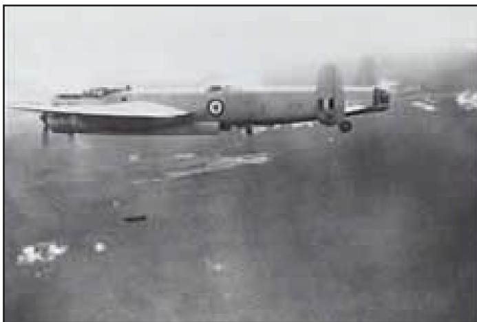
Photo 1: Lincoln Bomber A73-33, No.1 Squadron RAAF on a Bombing Mission over the Malayan Jungle.