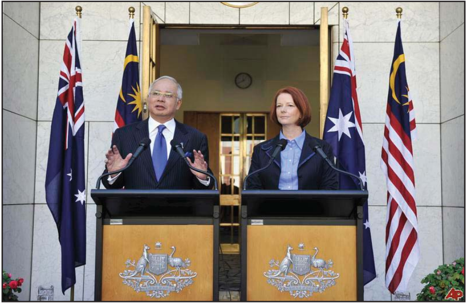
The Leaders of Malaysian and Australian Government

The long-standing relationship between Sabah (Malaysia) and Australia manifests that the foundation of the relationship is strong hence shall be further strengthened.