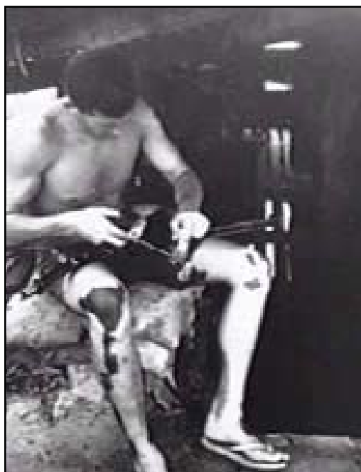
Photo 2: Member of the 4 RAR Cleaning a Bren Gun at a Camp Near Sarawak/Kalimantan Border in 1966.

The first Australian battalion from 3 RAR landed in Borneo in the month of March in 1965 and served in Sarawak until late July. During this period, the Australian regiment operated extensively in the areas surrounding both borders. They fought against the Indonesian army four times. Then, the 3 RAR was replaced by 28 th Brigade, 4 RAR, which was also placed in Sarawak from April till August 1966.