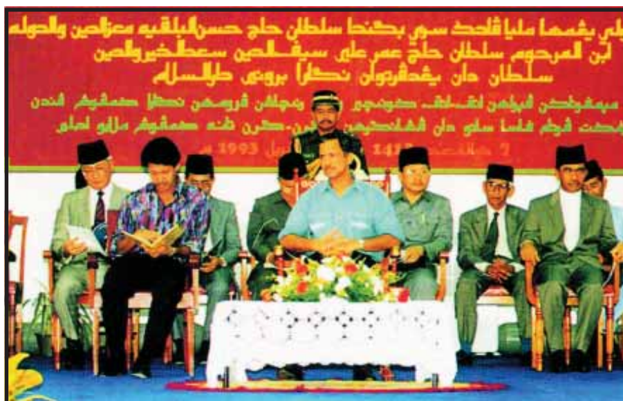
Since teachers are catalysts in the integrated education system, they should first and foremost understand the concepts and objectives and being able to fit in well into the realm of the integrated education system. His Majesty during the Ceremony at Ahmad Tajuddin Primary School at Kuala Belait on 29 April 1993.